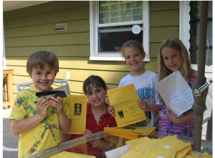
Our Volunteer Newsletter Staff

We still have a beautiful 10 by 15 foot tent available for rental by VM residents. $25.00 per day. Call 410-461-3026 for details. Those fall parties are just around the corner.