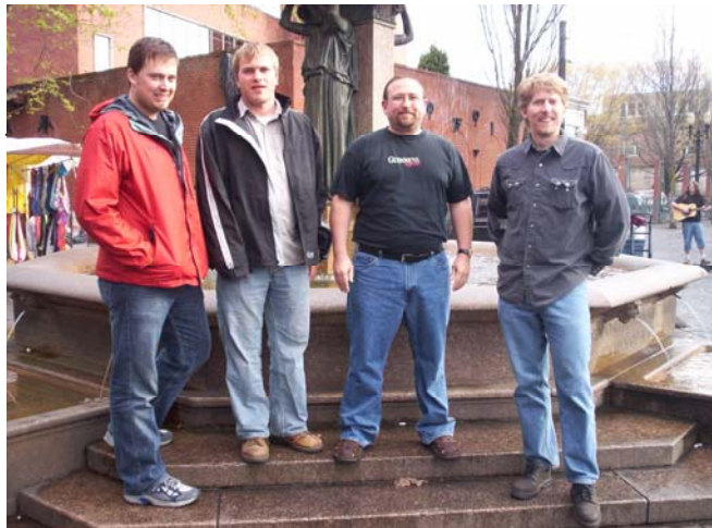
Lawn Chair will perform at the Festival

Lawn Chair creates acoustic twang and tear jerking – foot stomping music. Lawn Chair is a 3-piece Alt-Country/Americana band on Baltimore's Atomic Twang records. They come equipped with guitars, mandolin, upright bass, drums, lap steel, and harmonicas.