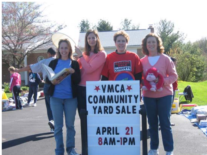
Bartering on Longview Drive